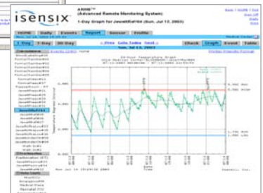
Automated Graphs & Reporting

Isensix, Inc 8555 Aero Drive, Suite 310 San Diego, CA 92123-1745